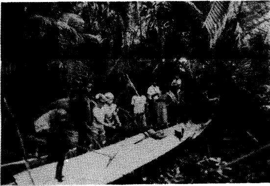
January 9 - This is the day we hike into the sago swamps. The boys all take turns chopping the pulp of the sago palm into fine powder.