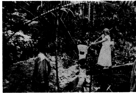
Women's work - The powder is washed and squeezed until only a gummy dough is left. Fried like a pancake and spread with peanut butter it is delicious!