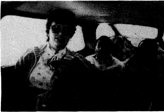
January 7 - We're finally off to the village, but we don't know if we'll be able to land when we get there. The report on the airstrip has not come in, since last night's rain. We had to