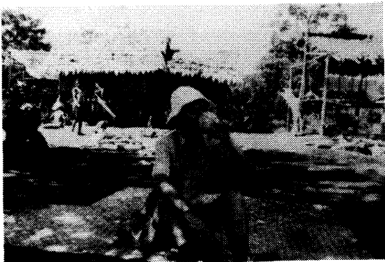
Time out for a morning coffee break uh, coconut milk break? Good to the last drop!