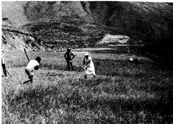
Cutting grass on the Sopus airstrip - by hand. The strip rises with a 12 degree grade and drops off at one end.