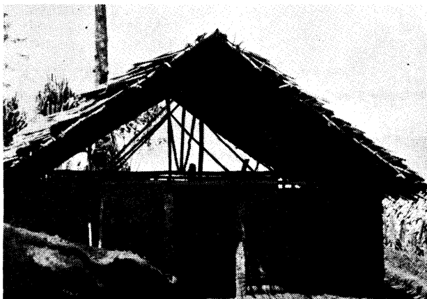
The new church building in Sopus. It comfortably seats 120. Pray that it will be filled soon.