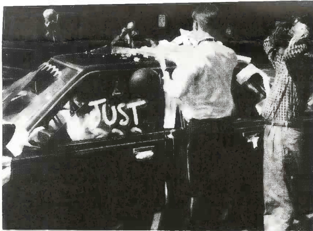
Leaving for the honeymoon.

family to meet our financial needs. Thank you for allowing Him to use you to bless us, so that we can work together to bring God's word to the Bibleless people. We pray that God will meet all your needs; spiritual, emotional, physical, and financial. God Bless You!