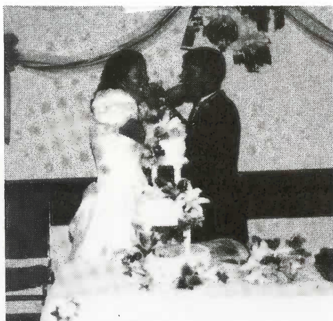
The cake is delicious.